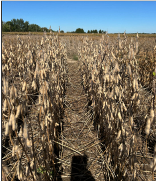
Maintains plant height. Woodstock, ON - Sept 2025

Broad adaptation across acres with well-rounded disease package, including white mould. Great option for mid to lower yielding acres with large canopy to maximize yield and close rows.