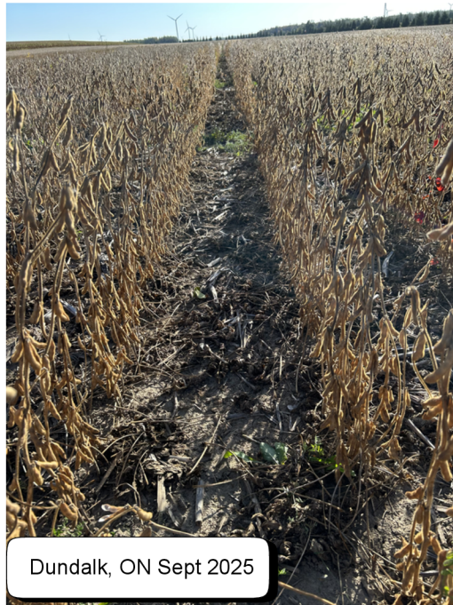
Dundalk, ON Sept 2025

Wheeler R2X is a large plant type that quickly fills in the rows to maximize yield in this ultra-early maturity. SCN resistance and white mold tolerance allow for broad placement.